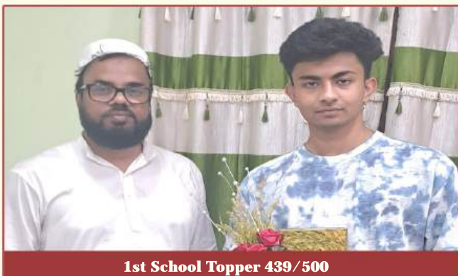
1st School Topper 439/500